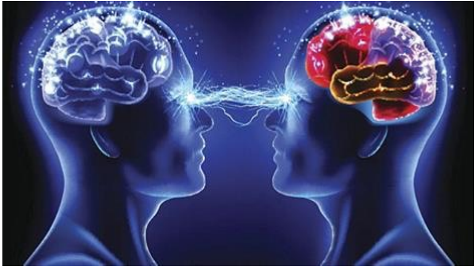
MIRROR NEURON ACTIVITY